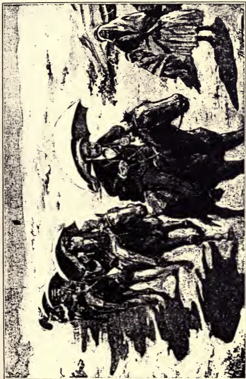
OUR PARTY OF EIGHT