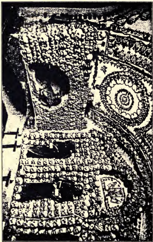
A CORNER IN THE CAPUCHIN CONVENT