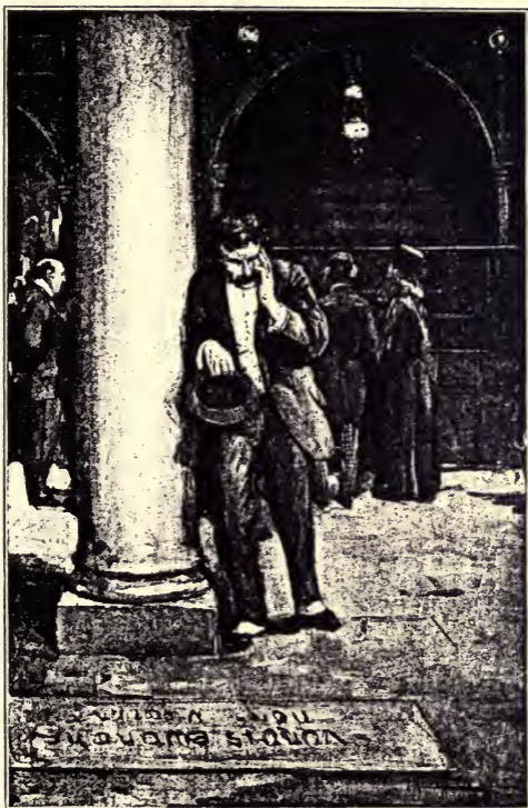
THE TOMB OF ADAM